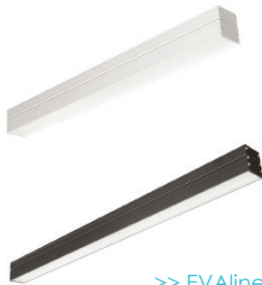
>> EVAline Aqua HE luminaire

EVA Optic is specialist developer of high quality LED solutions for swimming pools and indoor sports facilities. All products are developed and manufactured inhouse in the Netherlands.