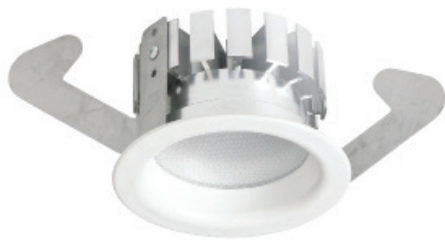
>> EVA DL Lemi

EVA Optic is specialist developer of high quality LED solutions for demanding environments. All products are developed and manufactured inhouse in the Netherlands.